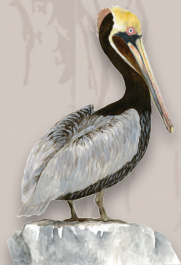
CALIFORNIA BROWN PELICAN